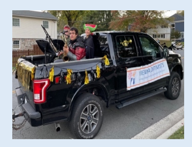
Members of the Madison Jazz Band